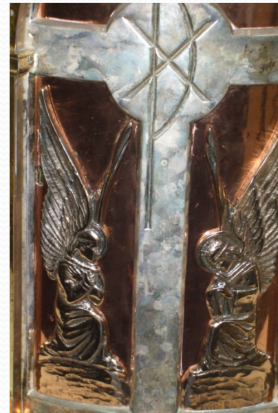
Tabernacle from Loreto Chapel