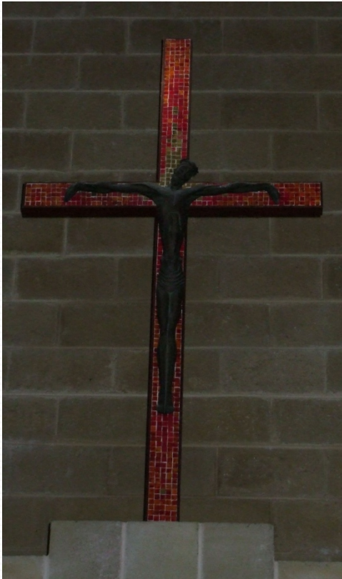
Crucifix from St Louis