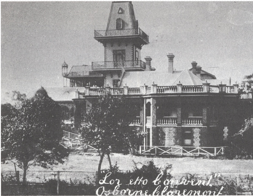
A 1908 view, showing the walking balconies and verandas. (Loreto)