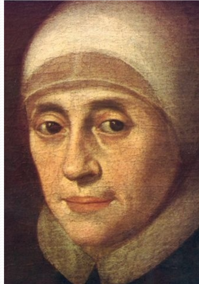
The Augsburg Portrait of Mary Ward (1585-1645) foundress of the Loreto Sisters.