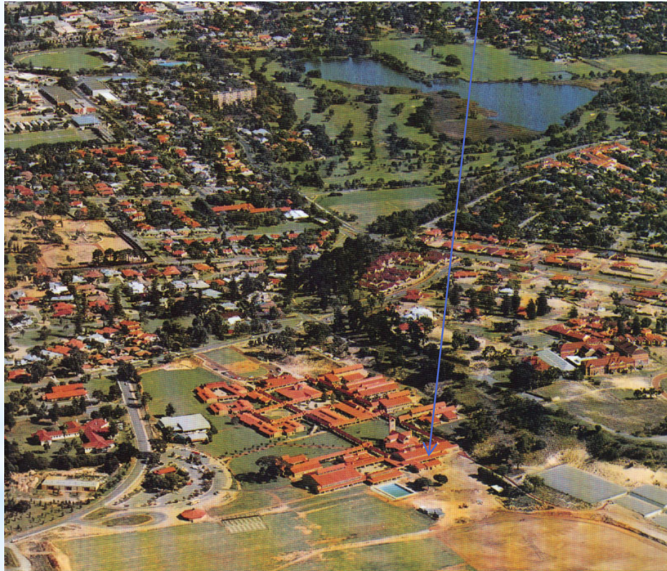
JOHN XXIII COLLEGE 1992